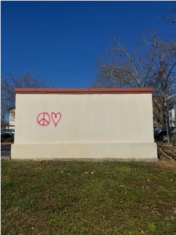
3. Detail Wall C